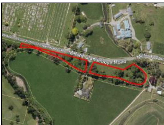
Figure 1: 0 Domain Avenue, Temuka