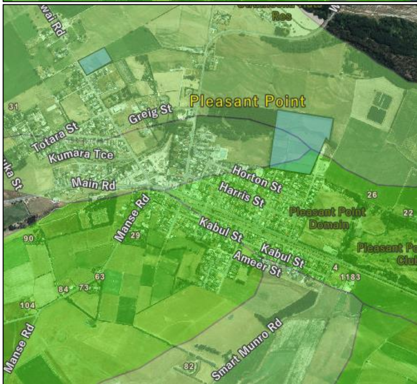
Figure 4: Pleasant Point Growth Requests (blue) and LUC1, 2 and 3 (green).