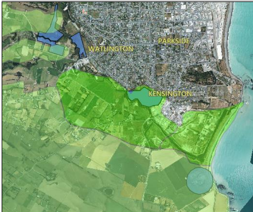
Figure 2: Timaru Growth Request South (blue) and LUC1, 2 and 3 (green).