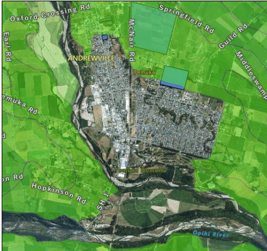
Figure 3: Temuka Growth Requests (blue) and LUC1, 2 and 3 (green).